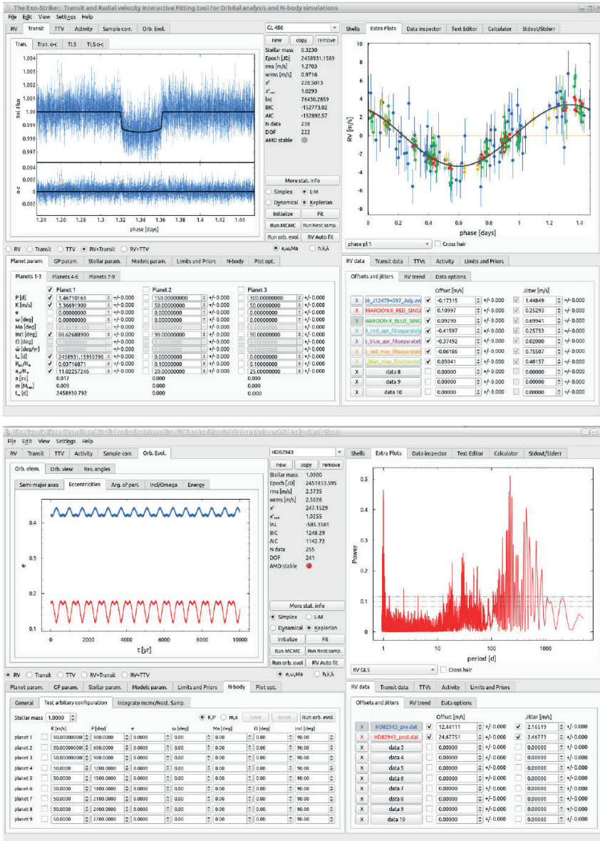
Fig. 2. GUI screenshot of the Exo-Striker exoplanet toolbox, which provides easy access to orbital analysis, interactive plotting, parameter overview, and statistics. The top panel shows a view of the transit+RV fitting results of the Super-earth discovery of GJ486 b (Trifonov et al. 2021a). The bottom panel shows a view of the N-body part, particularly an eccentricity evolution analysis of a 2:1 MMR two-planet system.