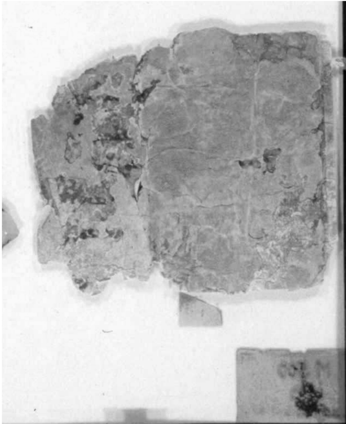
M500n/V before restoration