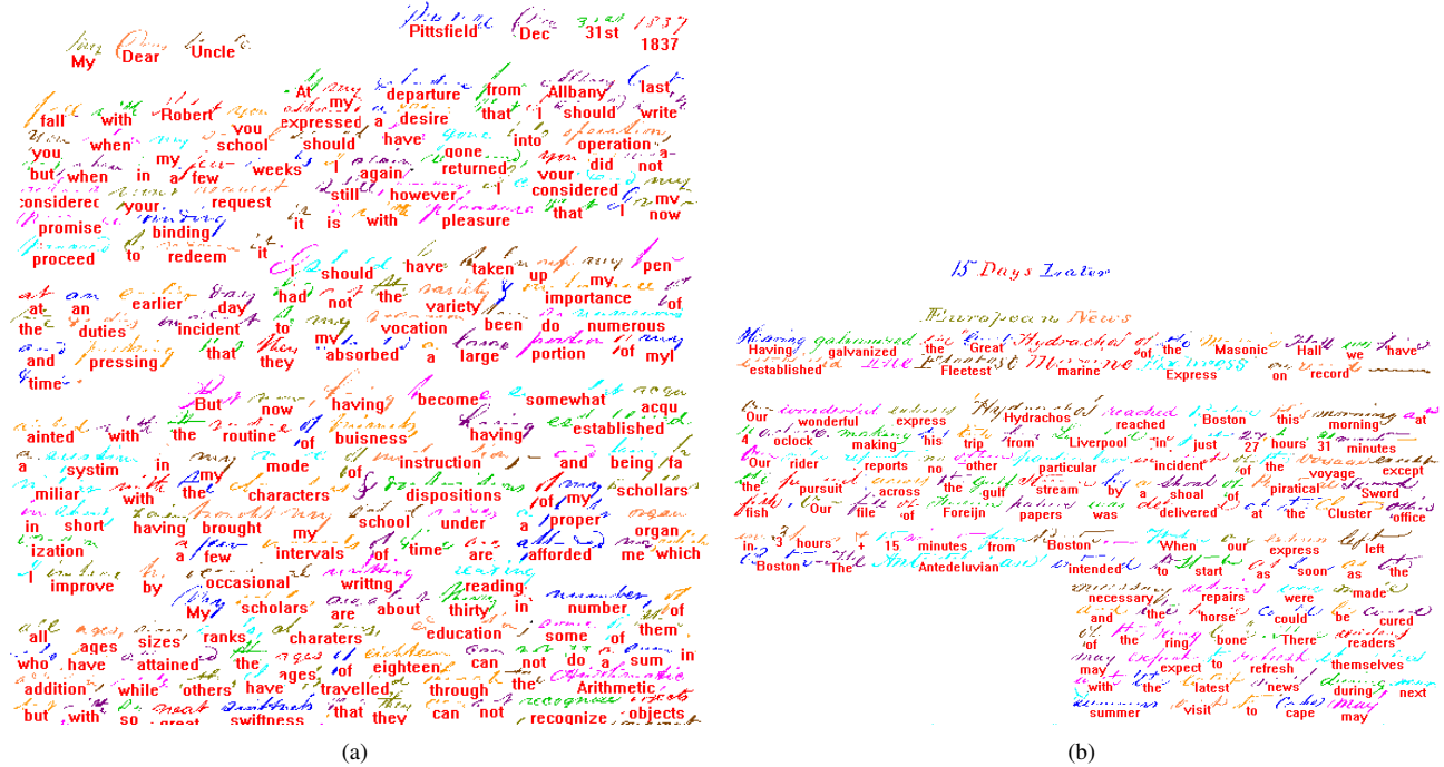
Figure 3: Pre-processed and truthed documents: (a) known writing of H. Melville, and (b) Hydrachos verso manuscript.